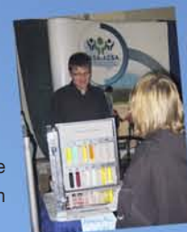
Chemical Look-A-Like Resource at CASA Booth at Agribition