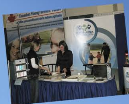
CASA Booth at Regina Agribition