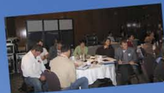
CASA's Annual General Meeting in Toronto