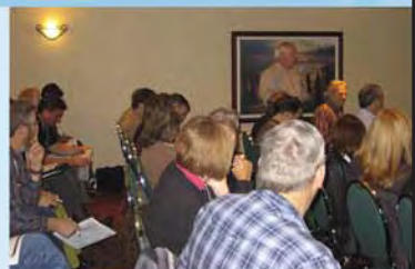
Casa Council Meeting