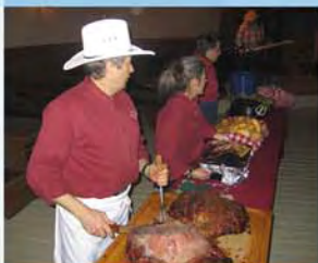
Banquet at Brewster's MountView BBQ